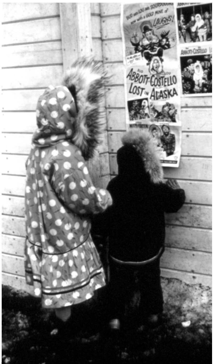
Page 6 Anchorage, Alaska